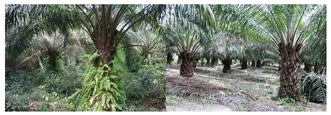
Plate 5. Contrasting oil palm treatments; normal practice (left) and Best Agricultural Practice (right), including regular weeding, pruning, contouring of soil to reduce rain water runn-off and deployment of pruned fronds between palms as a source of natural fertilizer.

We also obtained quantitative data on yields (number and combined weight of fresh-fruit bunches) obtained by every smallholder in the experiment at each harvest, stratified by month (Annex 7.16; Logframe Indicator 2.1 ). These data were obtained by employing a member of each smallholder community equipped with suitable measuring equipment, rather than by self-reporting by farmers, ensuring that data were independent, quantitative and objective.