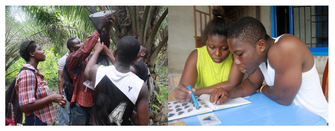
Plate 6. Sampling butterflies and moths (left) and identifying a collected specimen (right)

each case ( Logframe Indicator 2.2 ). Termites were sampled by timed hand-sorting of four 1m<sup>2</sup> soil samples at each research plot. Identification from external morphology has proven challenging and so we are now developing and testing an alternative approach based on molecular analysis of DNA; initial results are promising and we hope to complete this analysis and publish our findings in 2019 or 2020.