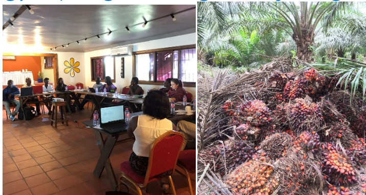
Plate 9 Tweet from our end-of-project Impact workshop

In addition, evidence and lessons learned from the project have been or will be disseminated broadly to a variety of international audiences ( Logframe Indicator 5.2 ) via diverse means including: (i) online publication of science-for-policy reports (http://www.sensorproject.net/); (ii) presentation of information at RSPO Roundtables in 2017 and 2018 (including an information booth within the conference hall, providing a very effective means of face-to-face discussion and knowledge exchange with conference delegates, and representing the 'voice of smallholders' in a dedicated conference session on RSPO Principles and Criteria; https://www.rt.rspo.org/c/rt15-programme/); (iii) presentations by four project partners and both DRFs at an international workshop on sustainable palm oil (University of Sheffield, UK, May 2018; Annex 7.23, and; (iv) Powerpoint presentations by two project partners at the following five international meetings and conferences: